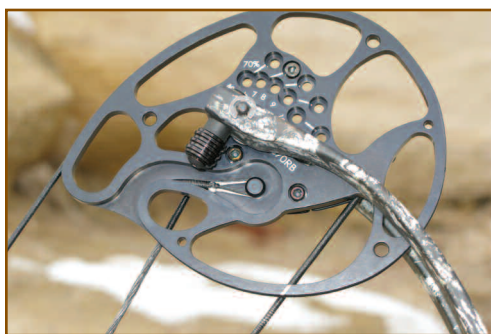
The Hybrid Fast Cams on the X-Force Dream Season deliver excellent arrow speed, along with a surprisingly smooth draw. They also feature interchangeable draw-length modules, timing marks and an easy-adjust letoff system.

The 2008 X-Force Dream Season feels like it draws smoother, still delivers outstanding arrow speed and shoots with an extra measure of forgiveness that is particularly welcome in a cold November treestand.